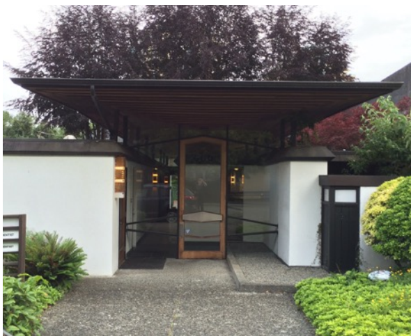
THE FRONT ENTRANCE