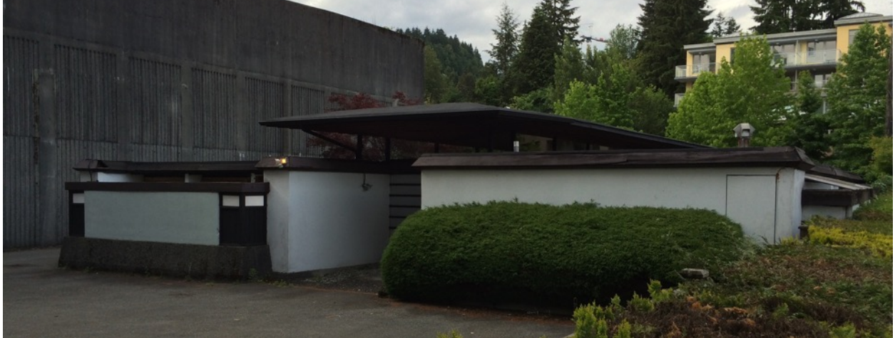
REAR OF THE BUILDING