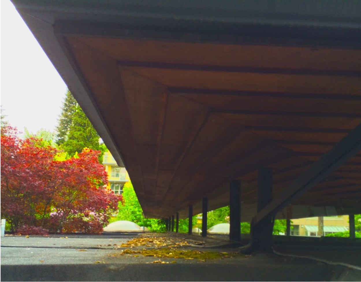
ROOF AND CLERESTORY