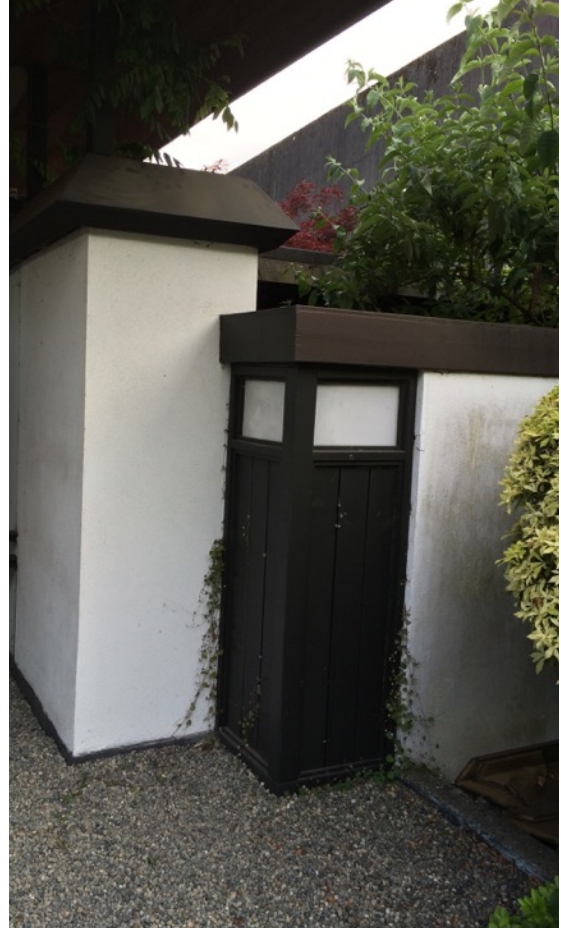
WOOD AND PLEXIGLASS PIERS WHICH ILLUMINATE THE BUILDINGS CORNERS IN THE EVENING