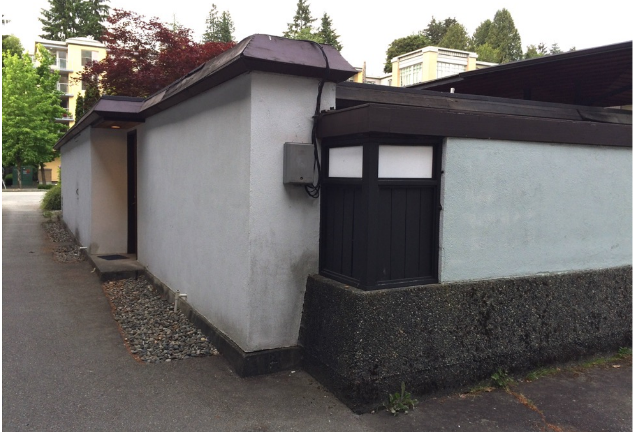
REAR OF THE BUILDING ABOVE: LOOKING NORTH BELOW: LOOKING ACROSS THE REAR NOTE THE CONCRETE SILL UNDER THE WEST WALL