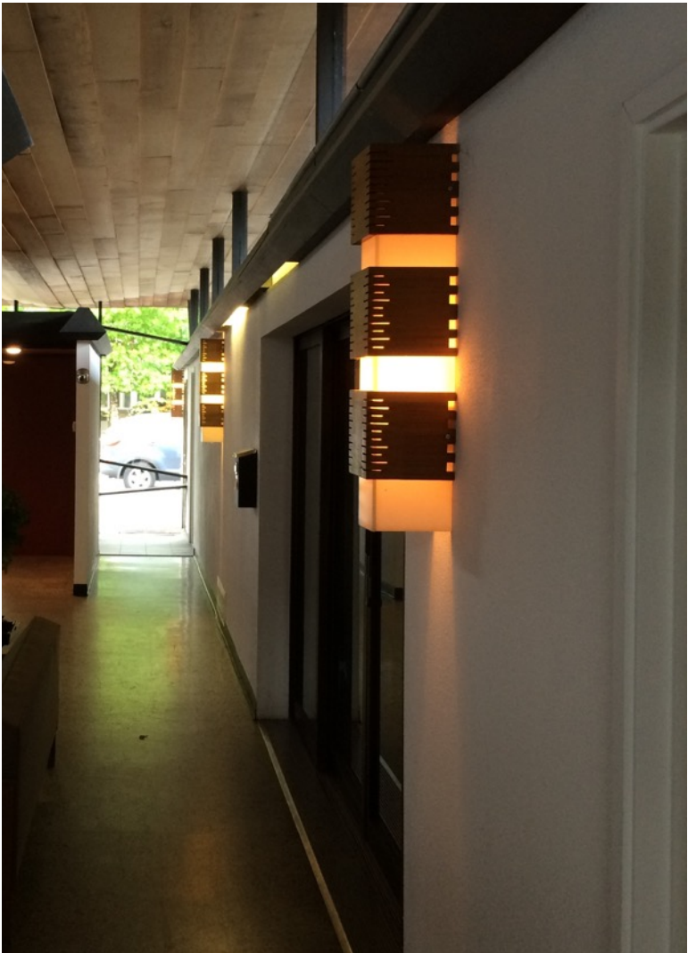
LIGHTING SCONCES AT THE FRONT ENTRANCE AND IN THE CENTRAL CORRIDOR