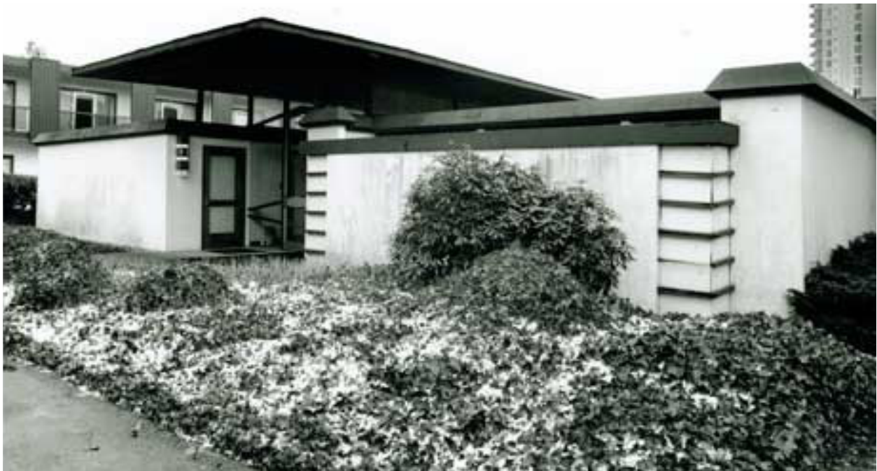
WOYAT-BOWIE BUILDING C.1988