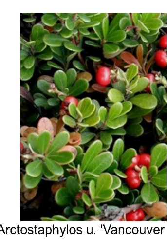
Arctostaphylos u. 'Vancouver Jade'