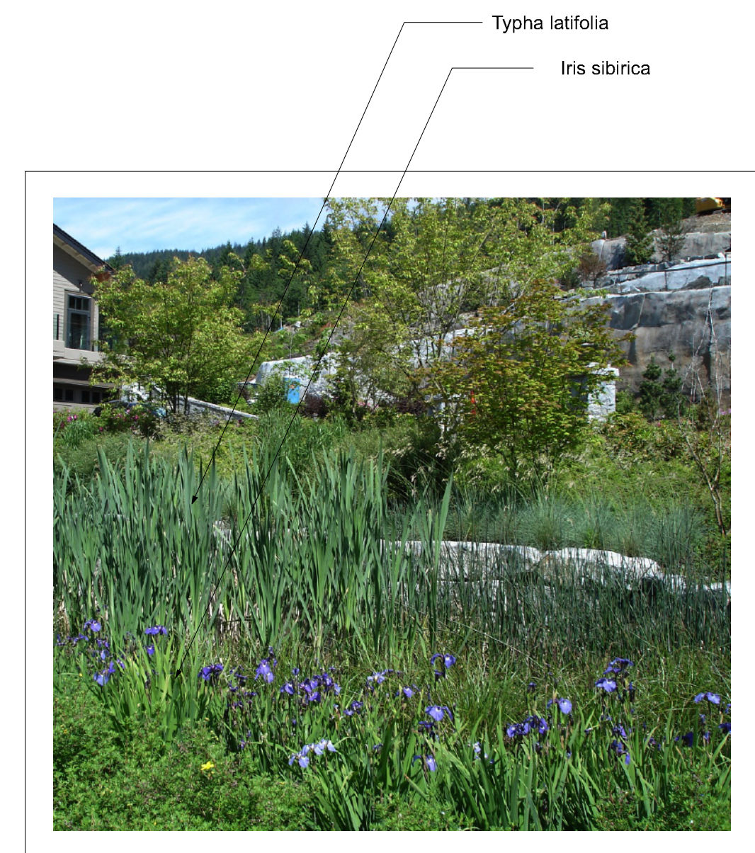
Typha latifolia Iris sibirica