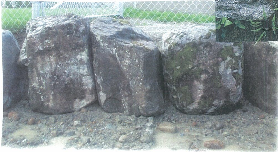
DRY STACKED WALLS