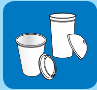
paper & plastic cups