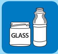
glass bottles & jars