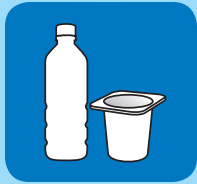
hard plastic containers