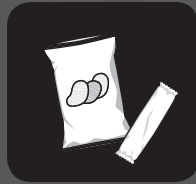
chip bags & candy wrappers