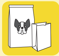
multiple layer paper bags