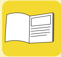
magazines & catalogs