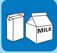
gable top & aseptic cartons