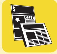
newspapers & flyers