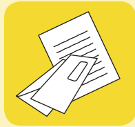
writing paper & envelopes

We take pride in keeping litter off our streets and recyclables out of the landfill. Please put your garbage and recycling in the proper bins.