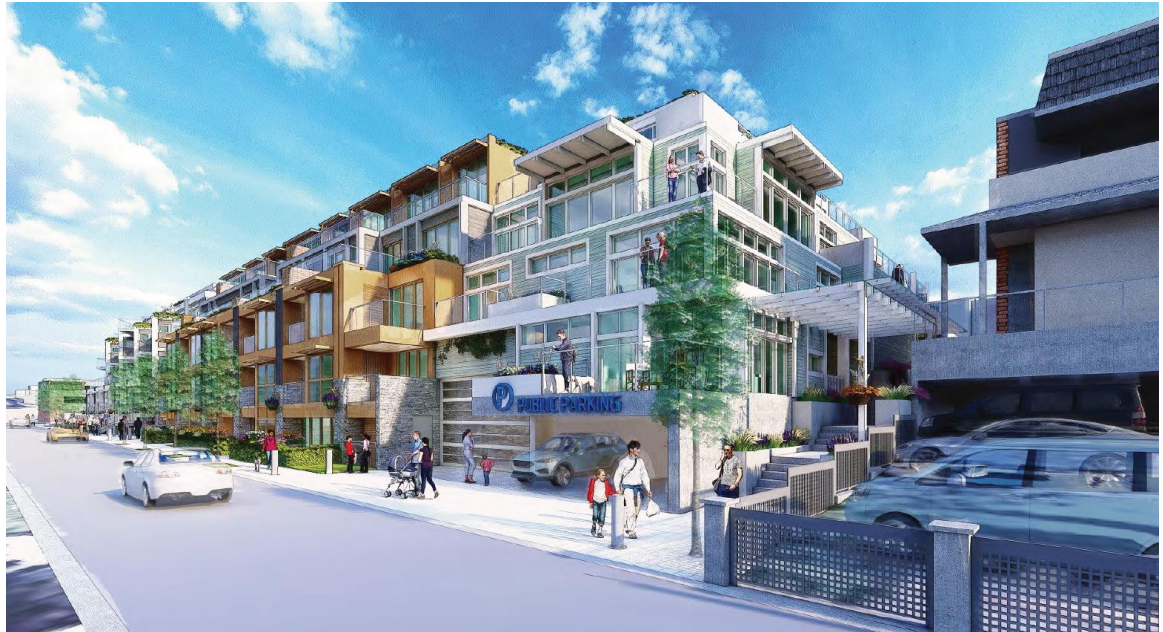
Figure 8: Dundarave Lane