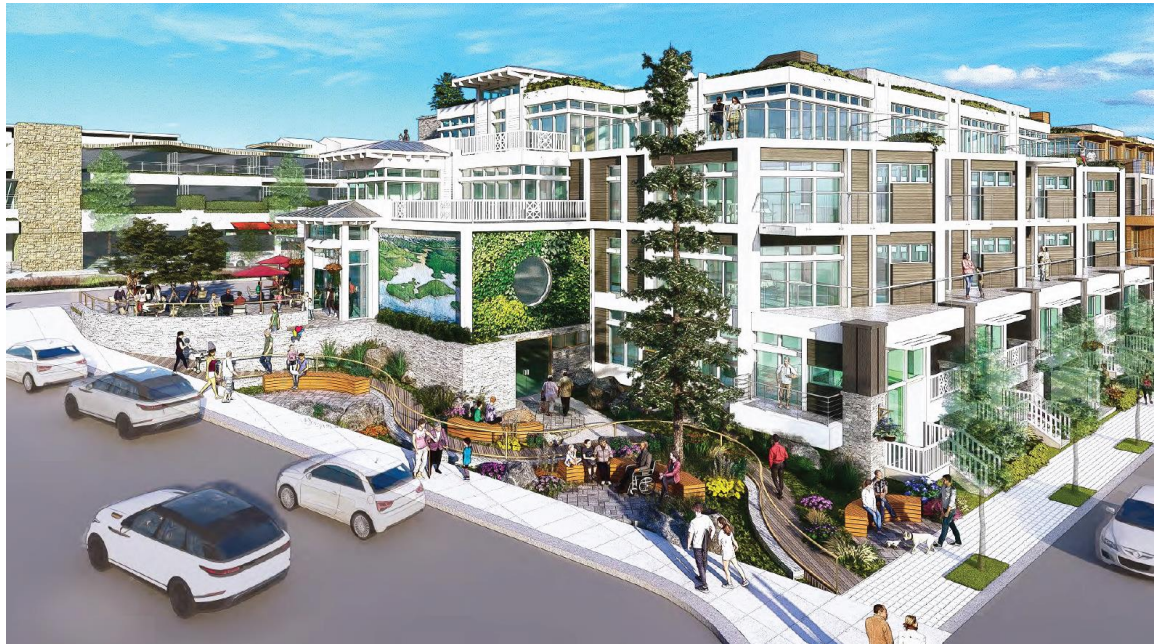
Figure 7: Public Plaza and Parkette