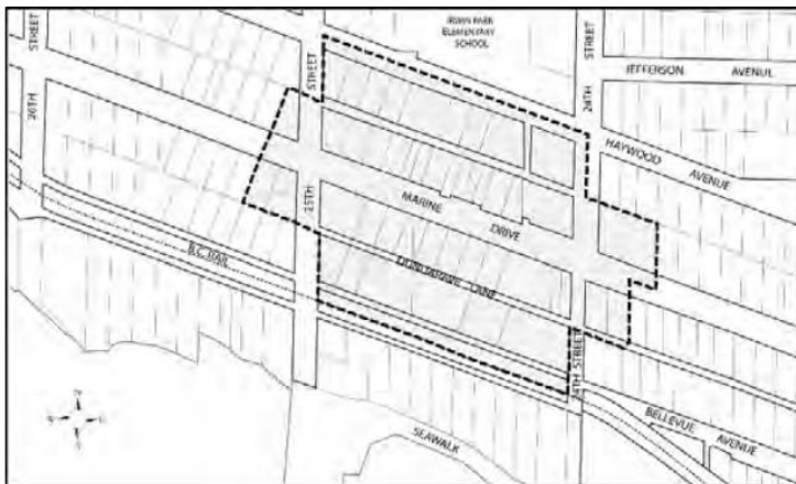
Dundarave Village Neighbourhood Centre Development Permit Area Designation Map BF-C 5