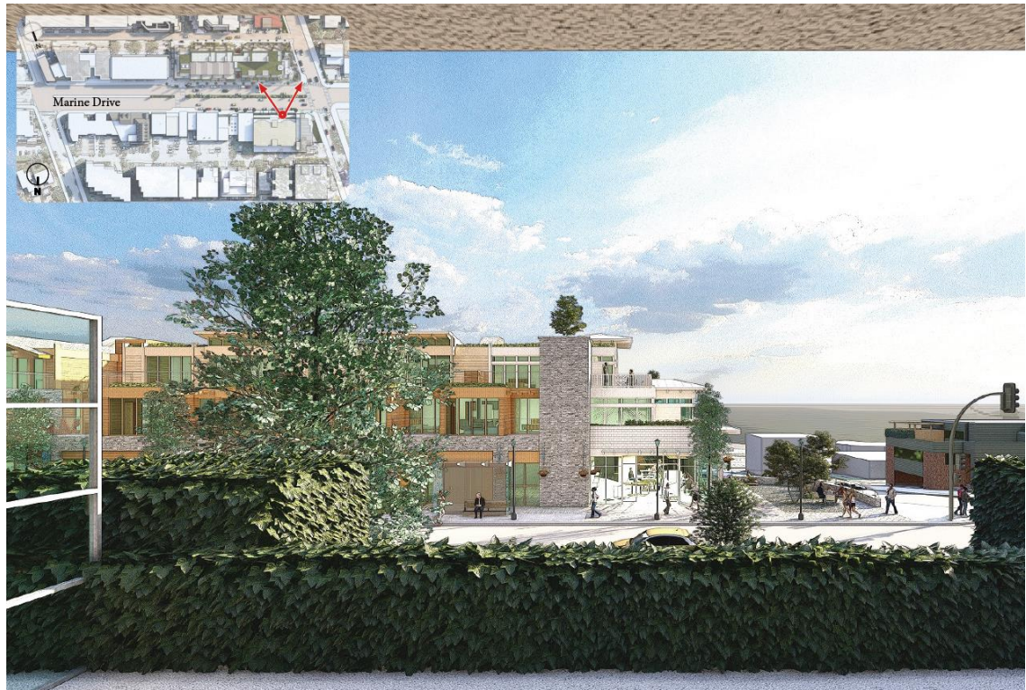
Figure 4: Proposed View from 1140 25th Street (above IGA)

The applicant has committed to incorporating public art into the project (see Public Art Advisory Committee below), and all loading areas, mechanical equipment, and waste and recycling are screened or located within the underground parkade to minimize the visual and acoustical impacts on adjacent properties and the streetscape. Redevelopment of the site will require infrastructure upgrades including new sidewalks, street trees, and updating the existing bus stop at 25th and Marine Drive. As part of the development, the applicant proposes to underground existing overhead wiring along the lane.