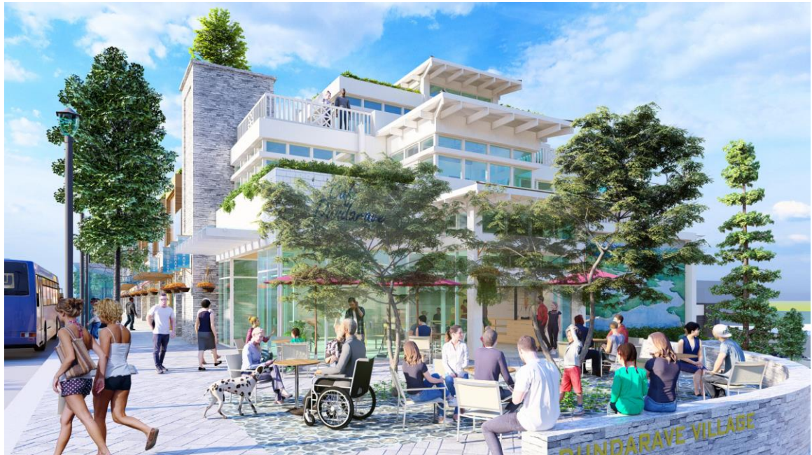
Figure 2: Looking southeast (at 25th Street and Marine Drive)

See Appendix C for the Project Profile and Appendix D for the proposed Development Permit. A rendering of the proposed development is shown in Figure 2.