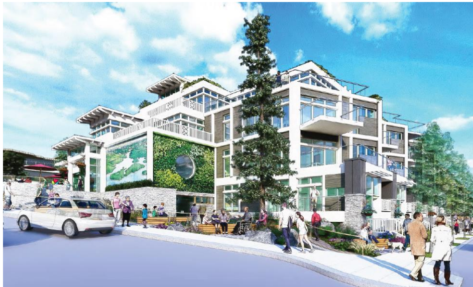
Figure 6: Looking northeast (at 25th Street and Dundarave Lane)

At the lane, the building takes advantage of the slope to create lower-level office or destination retail shops that do not require direct street front visibility. These units will activate the lane and together with a separated sidewalk allow for the safe movement of pedestrians. See Figure 6 for a view of the proposed building from 25th Street at Dundarave Lane.