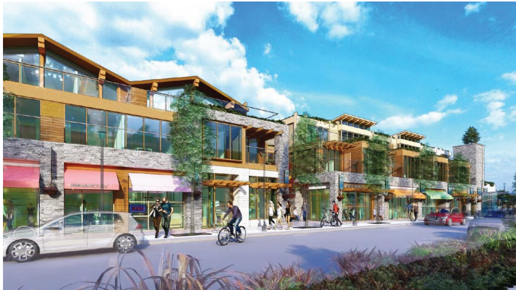
Figure 5: Marine Drive Frontage

In response to the guidelines, the upper floors of the building are setback to retain the lower building profile along Marine Drive and to reduce the overall scale and massing of the building. Although the additional storey will create impacts to private views for some residents to the north, the building is designed with varied rooflines and attention to detailing to minimize its scale to the area. The four rooftop accesses are minimized in size so that they do not add to rooftop building bulk. The varied roof forms, trellises, canopies, and railing details work together to provide further interest and variation to the upper floors of the building. The primary residential entrance lobby at Marine Drive further breaks up the overall massing of the building with its deep inset and change in materials. See Figure 5 for a view of the building from Marine Drive.