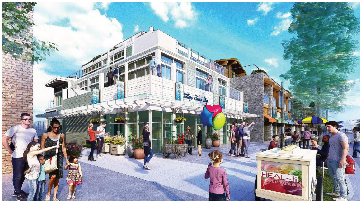
Figure 10: Mid-Block Pedestrian Connection (at Marine Drive)