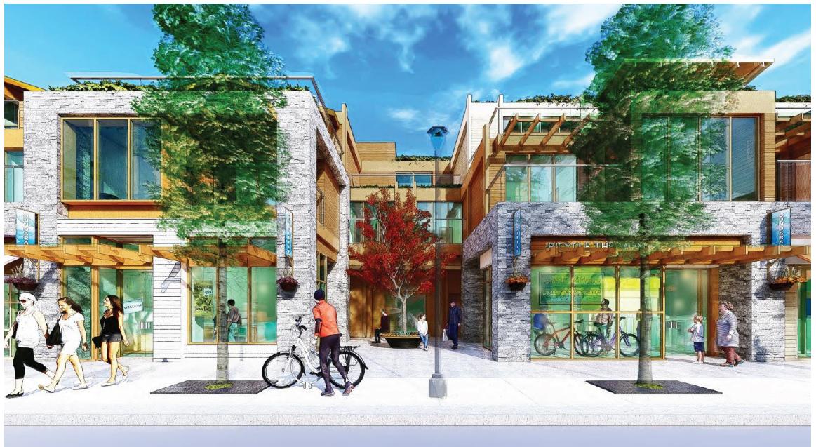
Figure 9: Courtyard at Marine Drive