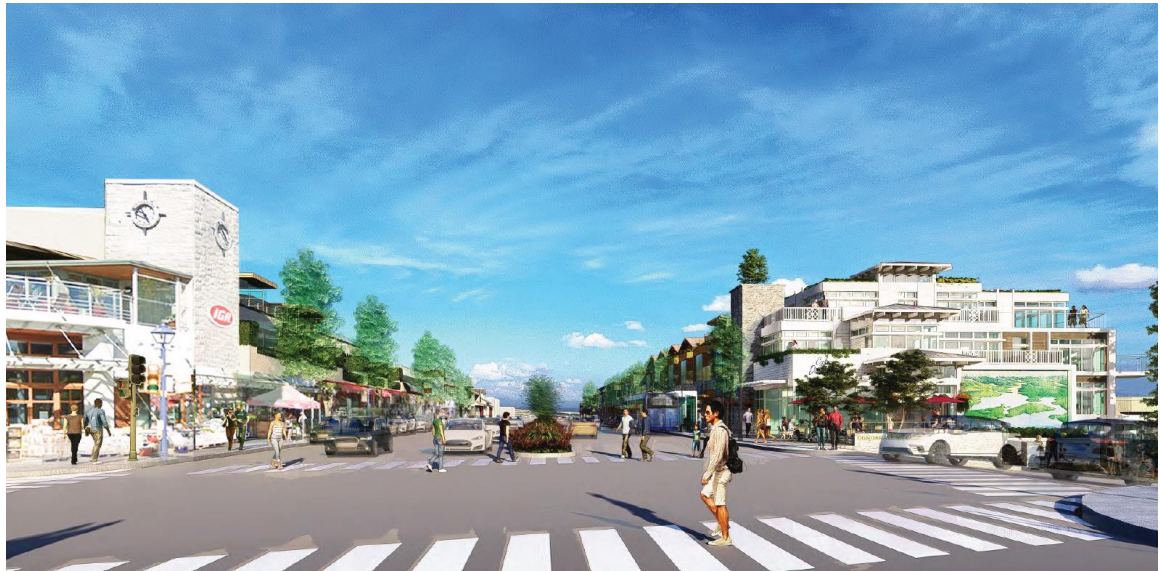
Figure 3: Context Image (proposed building on the right)

The proposed building meets the objectives for context and site design as it encourages a village character by providing street-level retail spaces, office uses at the lane, and residential uses above. Proposed is a continuous storefront street wall along Marine Drive with a renewed, fully accessible public plaza at the corner of 25th Street and Marine Drive to emphasize its role as a gateway site at the entrance to Dundarave. Although a street level setback along Marine Drive is not required under the existing C2 zone, the applicant proposes a 2 m (6.5 ft.) setback from the property line to provide a wider sidewalk. The project complies with all other required setbacks. See Figure 3 for a context image of the proposal.