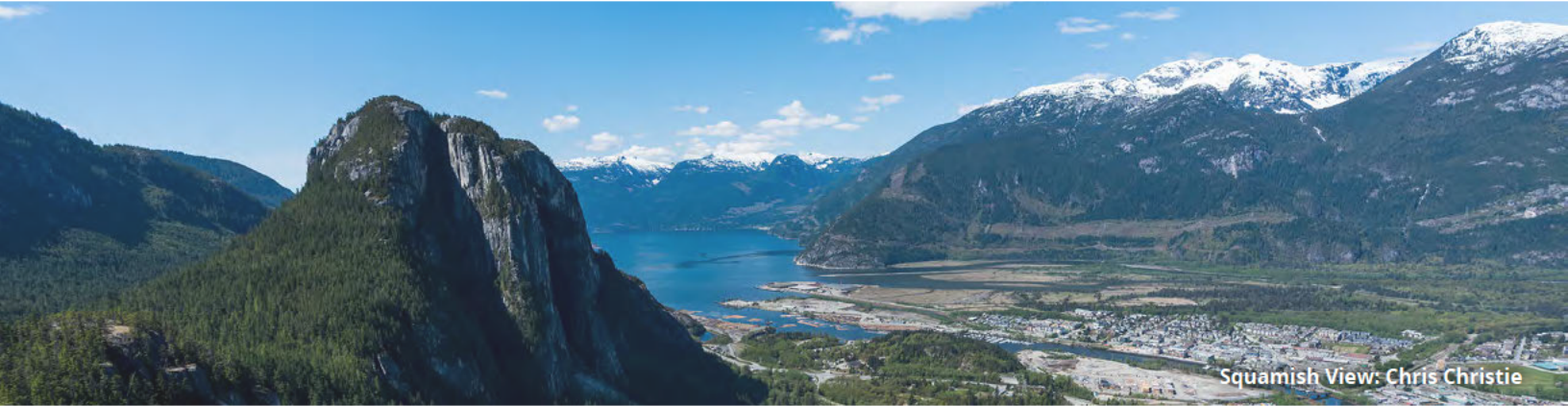
Squamish View