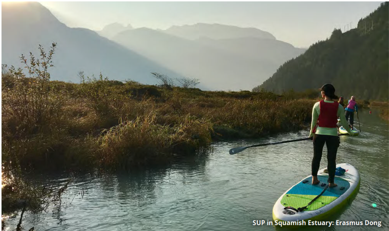
SUP in Squamish Estuary: Erasmus Dong

Please visit howesoundbri.org/unityplan to answer our discussion paper questionnaire.