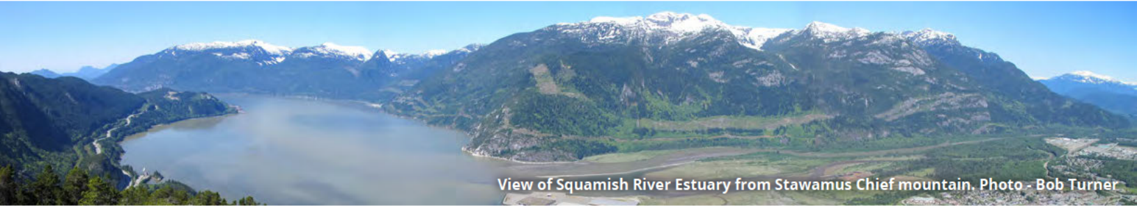
View of Squamish River Estuary from Stawamus Chief mountain.