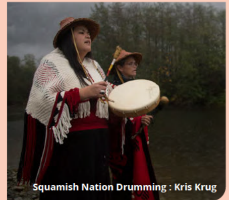
Squamish Nation Drumming

We are committed to engaging with Indigenous Peoples, all levels of authorities, the public, environmental NGOs, opinion leaders and industrial users, all of whom have varied and unique contributions to make on the path to the Nchu' 7mut/Unity Plan.