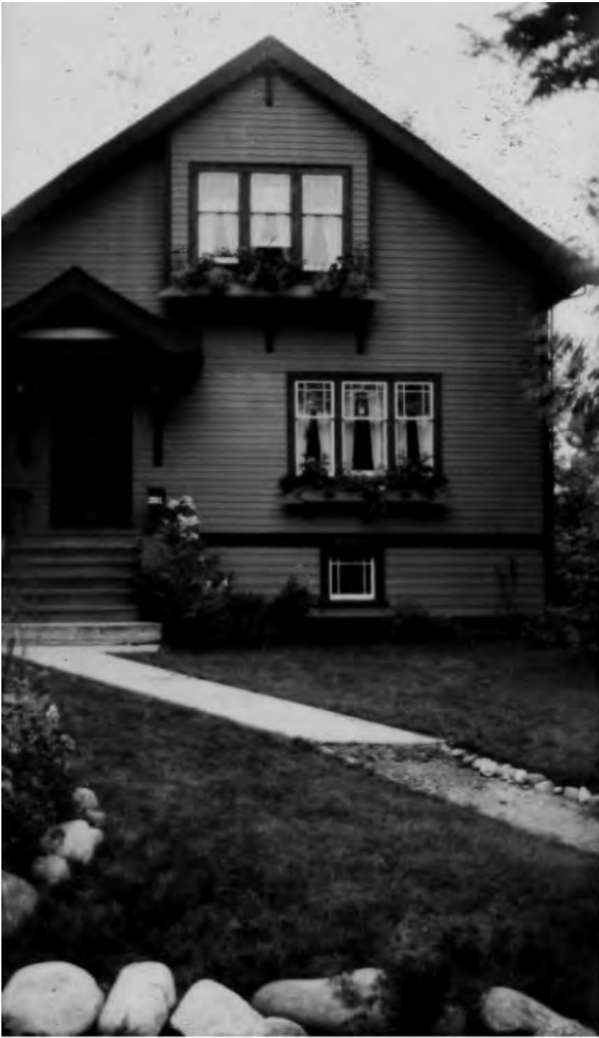
Clegg House Circa 1930