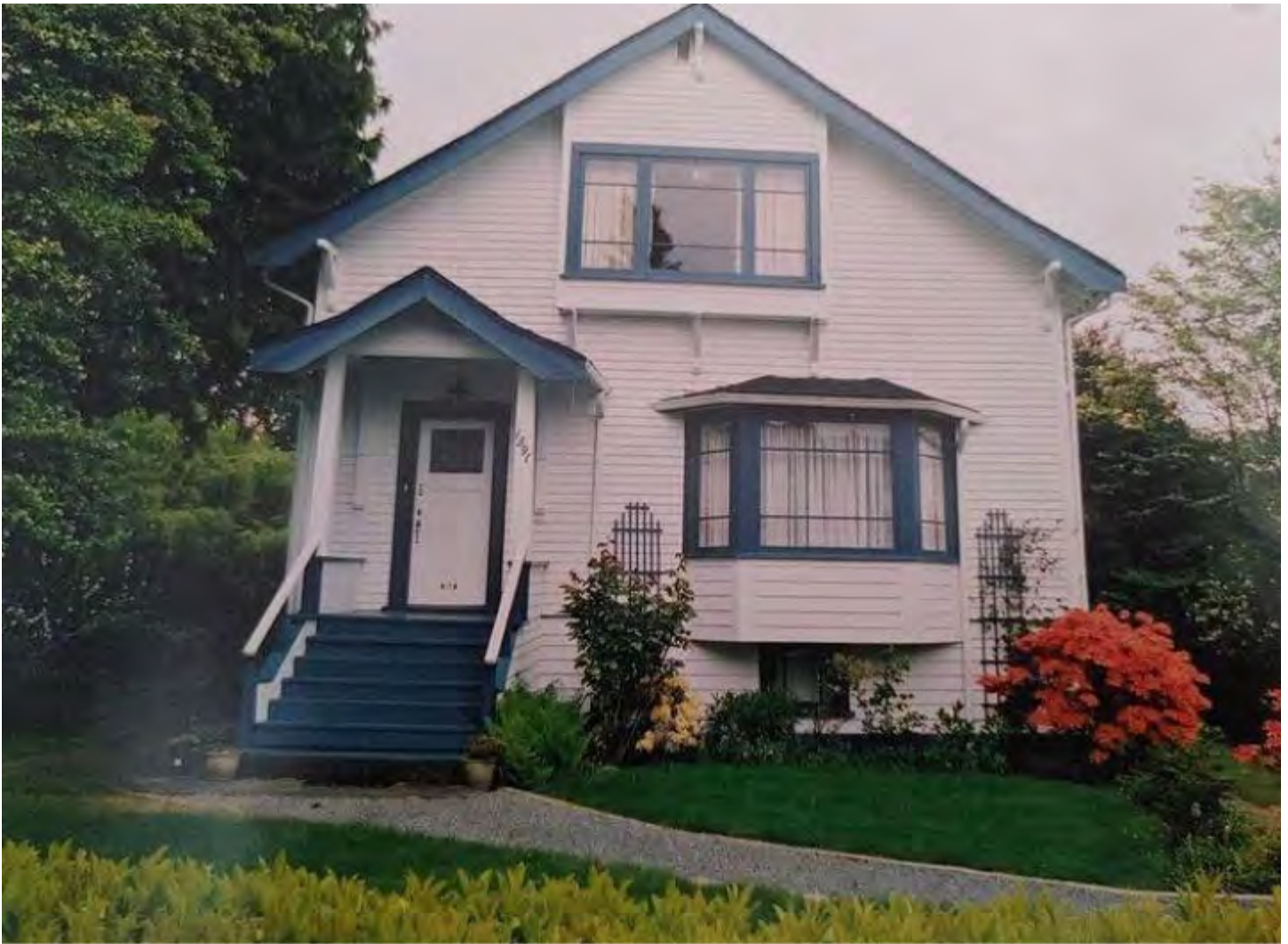
Clegg House circa 1970

c) [REDACTED] s. 22(1) is the district's go-to heritage expert and it was he who evaluated and poorly scored this property's heritage value in that 1987/88 evaluation. Wouldn't it have been prudent to have sought his objective opinion on eligibility for adding the Clegg House to the CHR, rather than having relied on the subjective reports from the applicant and their heritage consultant, especially when it was so obvious that the real motive behind the development application is less about heritage preservation and more about getting their hands on the HRA benefits - i.e. permitted variances, extra density, waived Community Amenity Contribution, etc.