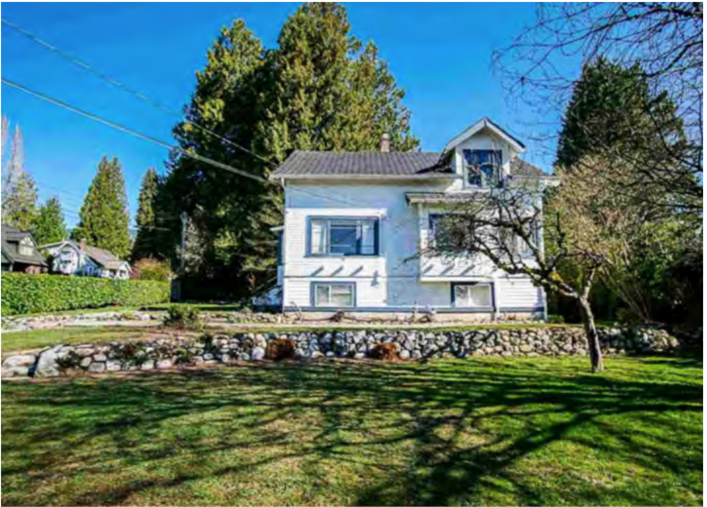
Clegg House 2021