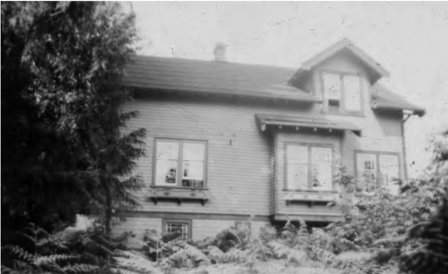
Clegg House circa 1930