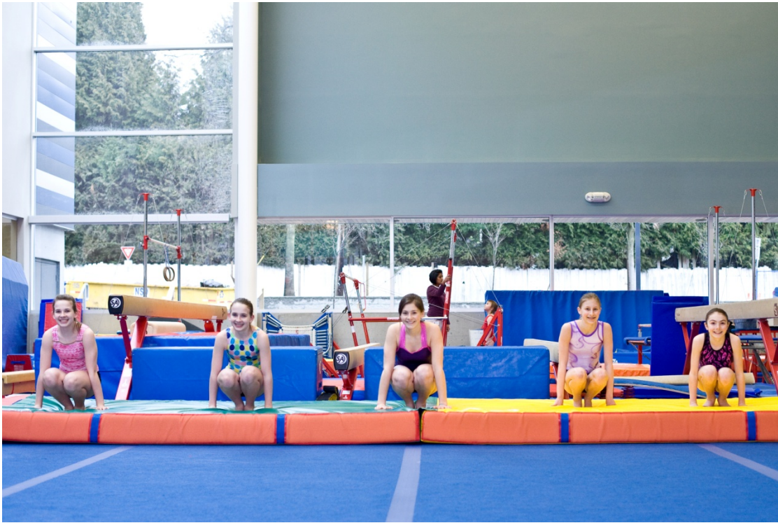
indoor wall – photograph courtesy of Claudette Carracedo