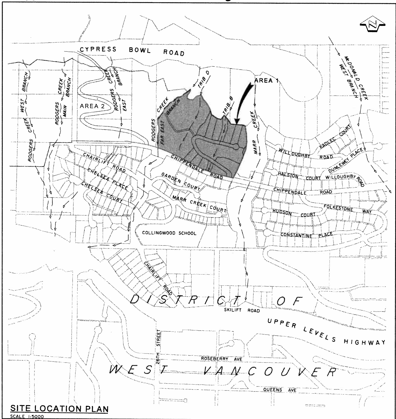
Context Plan showing Area 1