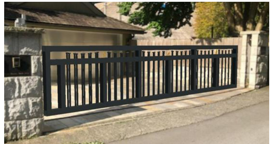
Rendering of proposed gate at 4648 Piccadilly South