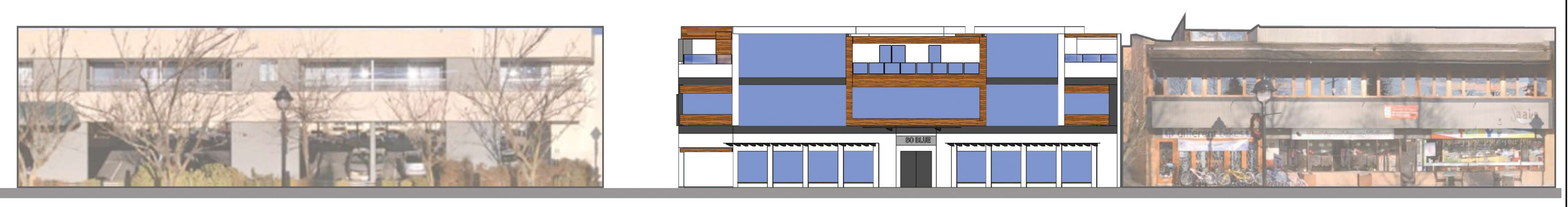
Streetscape along Bellevue Avenue