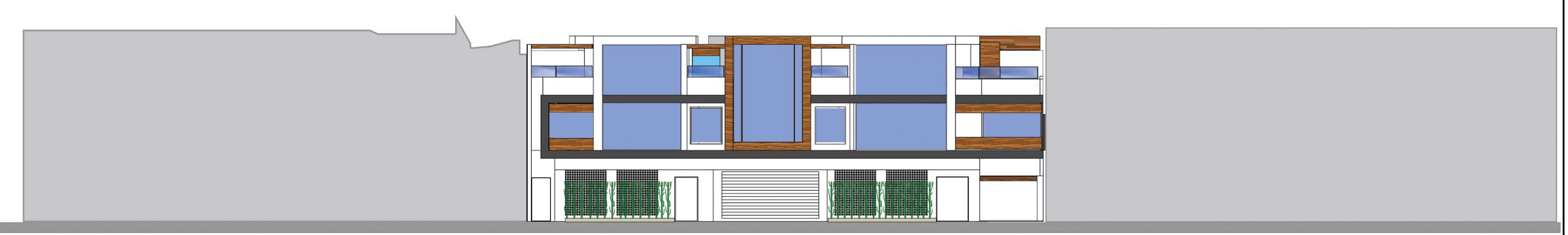
Streetscape along Ambleside Lane