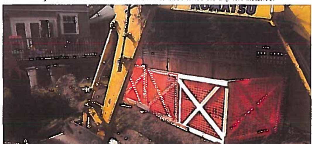
Tree fencing-wood framed snow fence