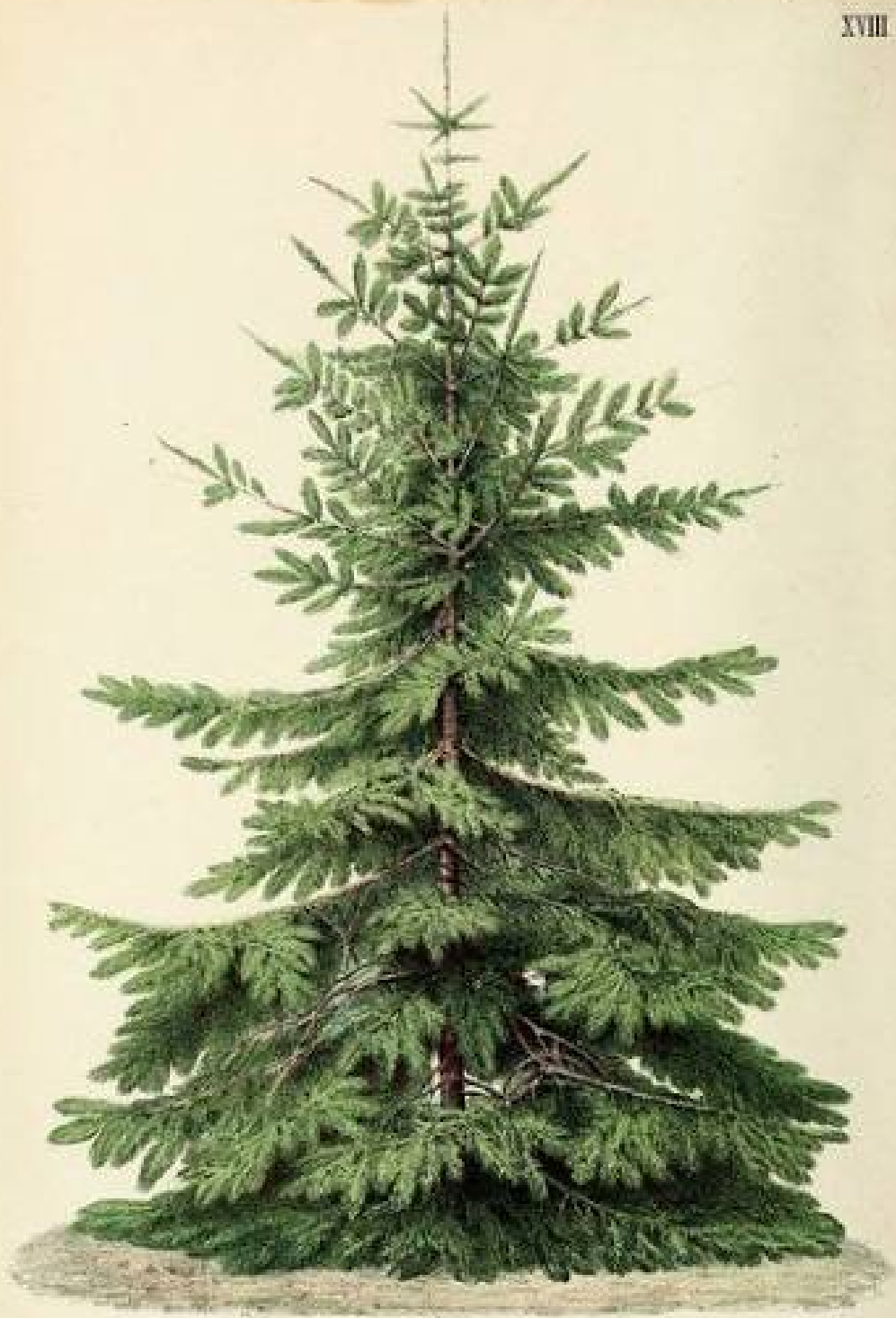
ABIES NORDMANNIANA LK.