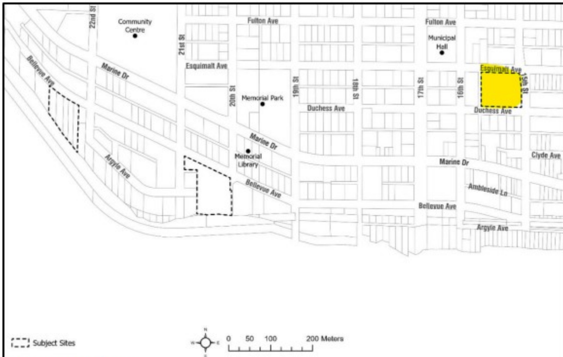
Map 6 D: Infill Sites

with appropriate heights to be determined through contextual review of the proposal. Infill housing on the 1300 block of Bellevue Avenue (Villa Maris) should be sited to minimize view impacts from the north and east to the south, with the preferred location for an infill building to be south of the existing building.