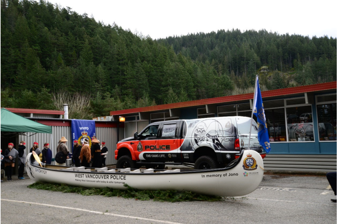
Ford F350 with Cab

Sample of former WVPD police vehicle wrap: